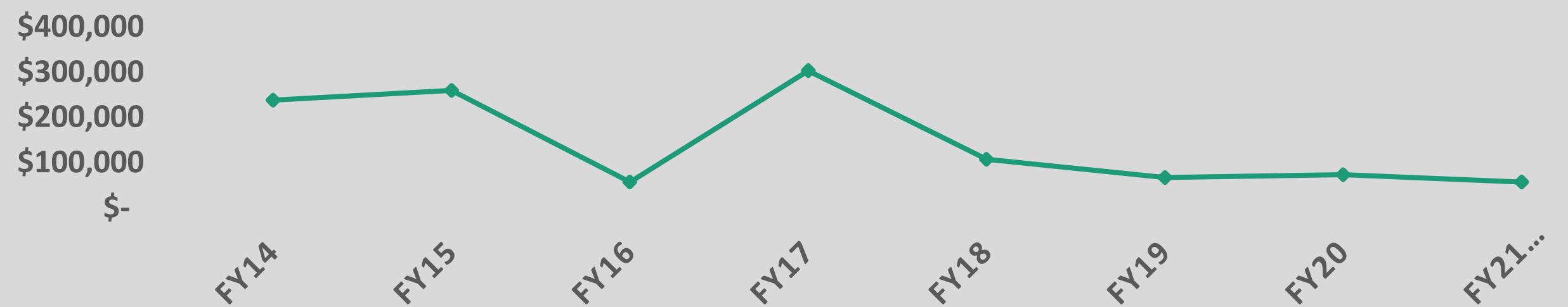
UASI FUNDING SINCE FY14