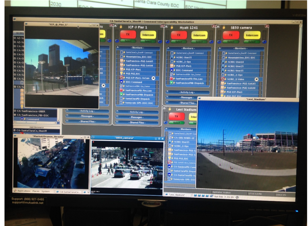
Mutualink at Sunnyvale Joint Information Center (JIC)