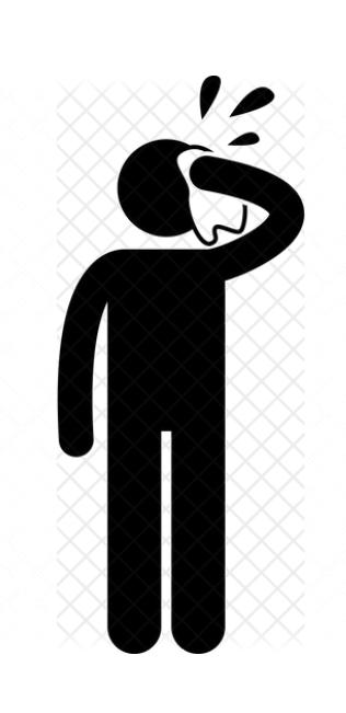
Heat Over Air Quality