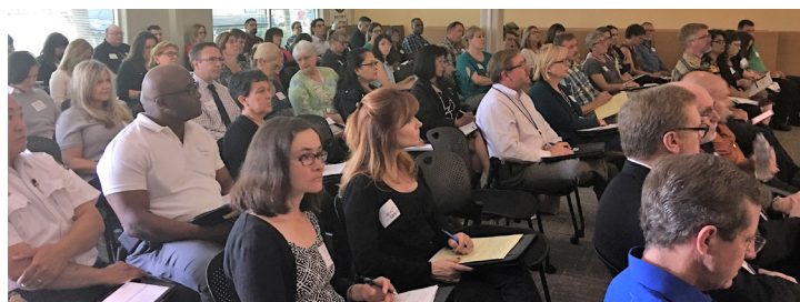
Over 75 attendees turned out for the Medical Needs in Shelters Workshop

The subcommittee will also continue developing essential resources such as the Memorandum of Understanding toolkit, a public information community outreach toolkit, and a review of animal sheltering plans. As the project nears completion, regional stakeholders will prepare for a full-scale exercise of simultaneously activated shelters and Emergency Operations Centers throughout the Bay Area.